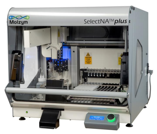
Fig. 2 The SelectNA™ plus robot for the automated host DNA depletion and extraction of microbial DNA.

The newest development is a fully automated system comprising the SelectNA™ plus robot which is run with the MolYsis-SelectNA™ plus kit and can be used for ≤1 ml liquid and 0.25 cm² tissue samples (Fig. 2). Handling is limited to the loading of the instrument with cartridges, other consumables and the samples. One to 12 samples can be processed by the instrument at a time. The kits above have been used for NGS analyses of various specimens, including urinary encrustations, necrotized hepatic tissue, rabbit organ biopsies as well as fluid samples like EDTA blood and broncho-alveolar lavage (Table 1).